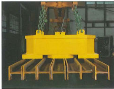
Lift layers of shapes or angles