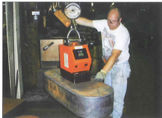
Infra-Red Remote Control Walker Self-Contained Battery Lift Magnets can lift steel up to 11,000 lbs.