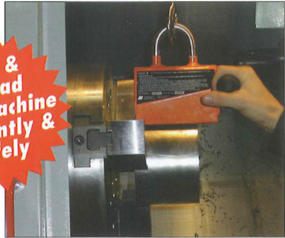
Small, but effective, 22 lb. Walker High-Powered NEO-250 magnets can lift up to 275 lb. Solid Round Bars

Load & Unload Your Machine Efficiently & Safely