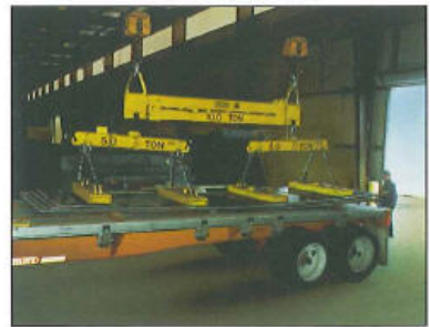
Reduce manpower unloading trucks

Walker Guaranteed Performance for Over 100 years