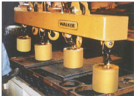
4 Walker Circular Magnets load and unload cut parts and skeletons from burning tables