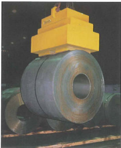
EYE-HORIZONTAL COIL MAGNETS

The easiest, fastest and most economical way to lift and handle coiled strip steel is to use powerful magnets designed specially for the job. Since the magnet is in contact and holding only the top of the coil, potential coil damage is virtually eliminated.