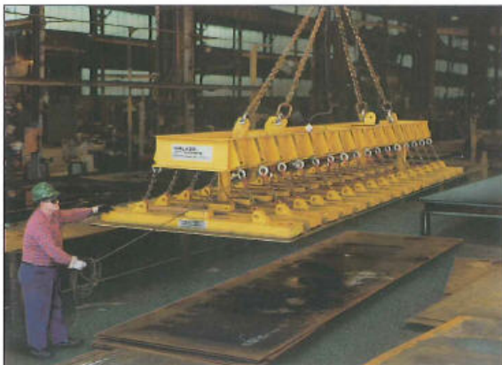
Maximum magnetic coverage for clearing cut parts and skeletons