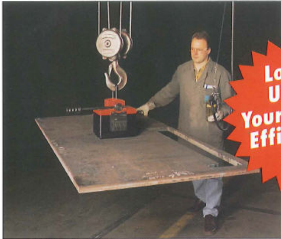
Walker Self-Contained Permanent Lift Magnets can lift 1 1/2 inch steel plates weighing up to 1760 lbs

Walker Self-Contained Lift Magnets include a wide range of Permanent, Battery Powered and Electro Magnets. These magnets handle a variety of plates, shapes and rounds.