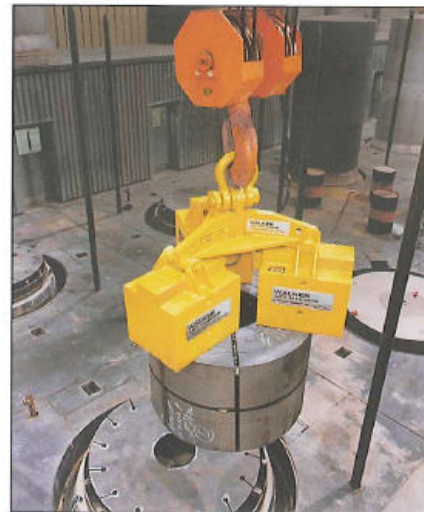
EYE-VERTICAL COIL MAGNETS

High-powered, deep-reaching magnets are designed to lift coils with the eye vertical