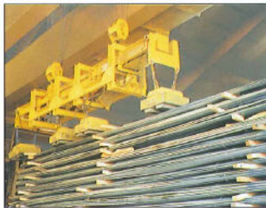
Lift multiple bundles of merchant product

Specifically designed spreader beams ensure effective, efficient and safe operation of these magnets for different material handling applications.