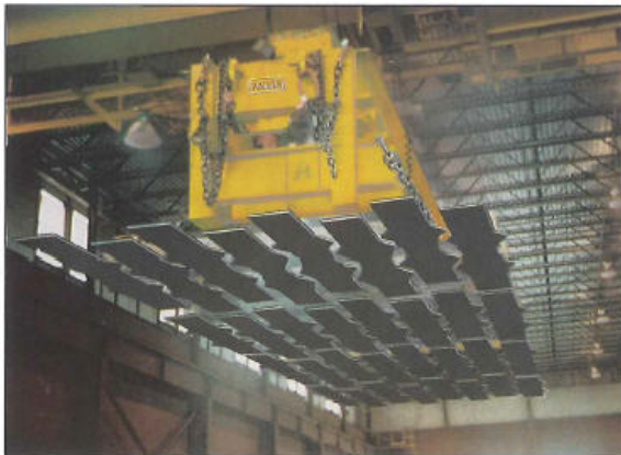
Flame cut parts can be lifted all at one time