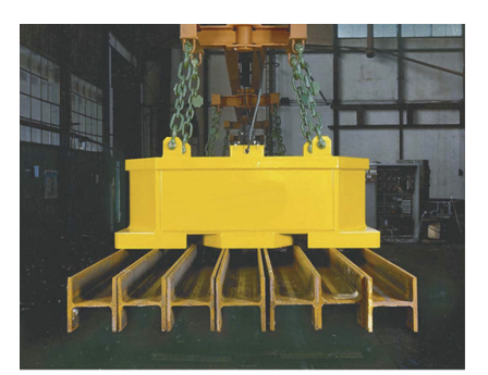
Lift layers of shapes or angles