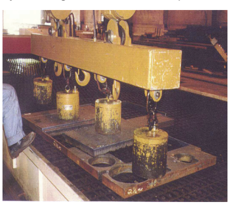
Walker Circular Magnets load and unload cut parts and skeletons from burning tables