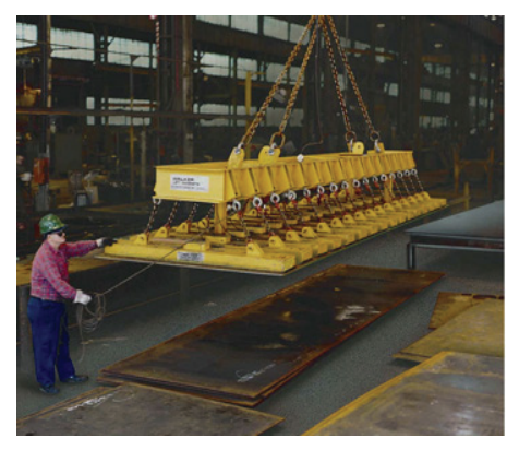
Maximum magnetic coverage for cut parts and skeletons