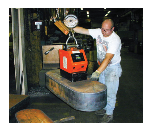
Infra-Red Remote Control Walker Self-Contained Battery Lift Magnets can lift steel up to 11,000 lbs.