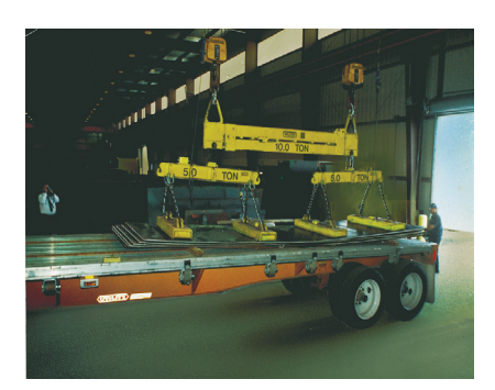
Reduce manpower unloading trucks

Walker Magnetics 600 Day Hill Road Windsor, CT 06095 800-962-4638