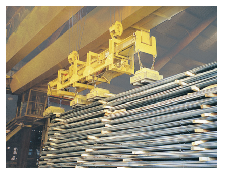
Lift multiple bundles of merchant product

Specifically designed spreader beams ensure effective, efficient and safe operation of these magnets or different material handling applications.